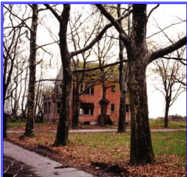
Former Wardens Hart Island residence. Continued on page two.

Yet the most important duty that Warden Dros had was to supervise the burials of the down and out, the unknown and the unwanted. To date they recognize over 800,000 are buried there and the figure could even go beyond 1 million because of loss of markers & records in 1902 and 03 due to grass fires about the Island.