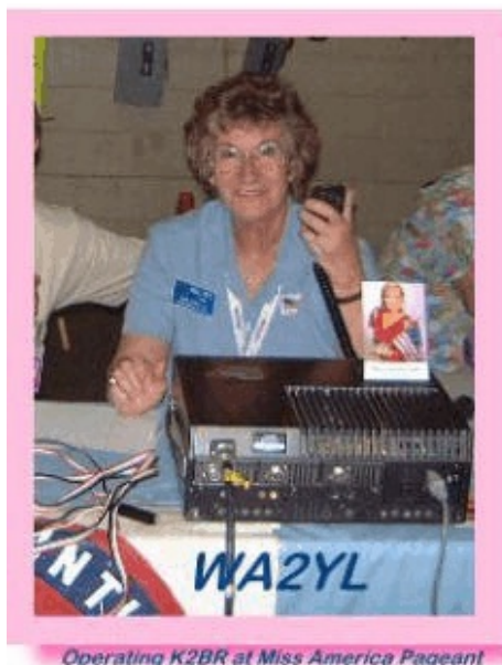
Operating K2BR at Miss America Pageant

Section Traffic Manager in Southern Florida, enjoyed attending “Hamfests.” She was well known even at the large Dayton hamfest. Her local activities included participation in the Fort Meyers Amateur Radio Club and assignment as hospital communicator with ARES in Lee County.